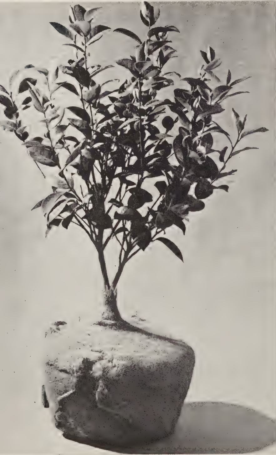
24-30 inch, Light Specimen Camellia B&B